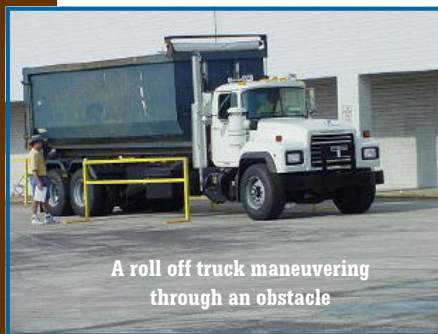
A roll off truck maneuvering through an obstacle

There are typically three separate competition categories – landfill equipment, truck equipment, and equipment mechanics. The truck category includes five different truck classifications, covering all aspects of solid waste collection and transfer. The 2010 Oregon Chapter Road-E-O will feature three of these truck classifications. They are roll-off, front loader, and automated side loader. This year, the Oregon Chapter Road-E-O event however will not include the landfill equipment or the equipment mechanics categories.