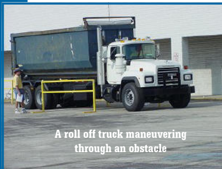
A roll off truck maneuvering through an obstacle

There are typically three separate competition categories – landfill equipment, truck equipment, and equipment mechanics. The truck category includes five different truck classifications, covering all aspects of solid waste collection and transfer. The 2010 Oregon Chapter Road-E-O will feature three of these truck classifications. They are roll-off, front loader, and automated side loader. This year, the Oregon Chapter Road-E-O event however will not include the landfill equipment or the equipment mechanics categories.