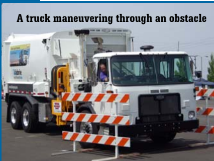
A truck maneuvering through an obstacle

A course walk-through will be conducted to introduce the drivers to the course and the seven obstacles that must be completed. The course is intended to test the driver's ability to start and stop the vehicle, negotiate the road, back up the equipment, and exhibit general safe driving skills. Once competition begins, the driver will be allowed a few minutes to familiar themselves with the piece of equipment they must use for the driving skills competition. When instructed, they must then perform a commercial driver license (CDL) pre-test inspection, including an air brake procedure of the vehicle. This will then be followed by the driving skills portion of the event. The competition also includes a short written exam on general knowledge of the equipment and driving safety.