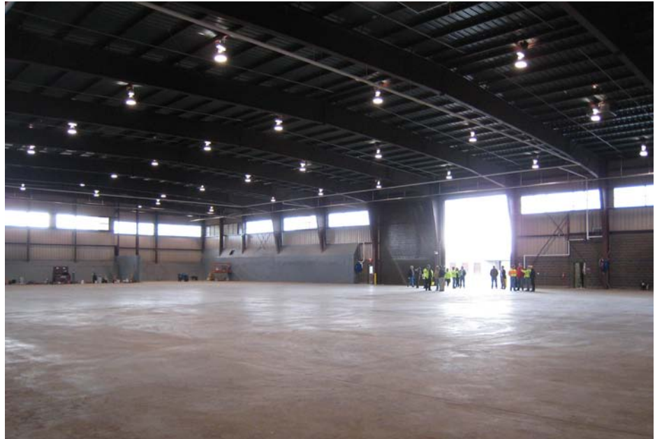
THE MAIN TRANSFER BUILDING AT KNOTT LANDFILL WAS READY FOR BUSINESS WHEN SWANA MEMBERS VISITED IN OCTOBER.